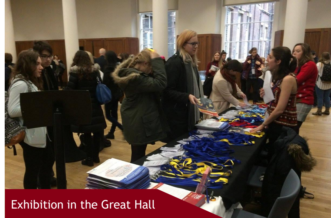
Exhibition in the Great Hall