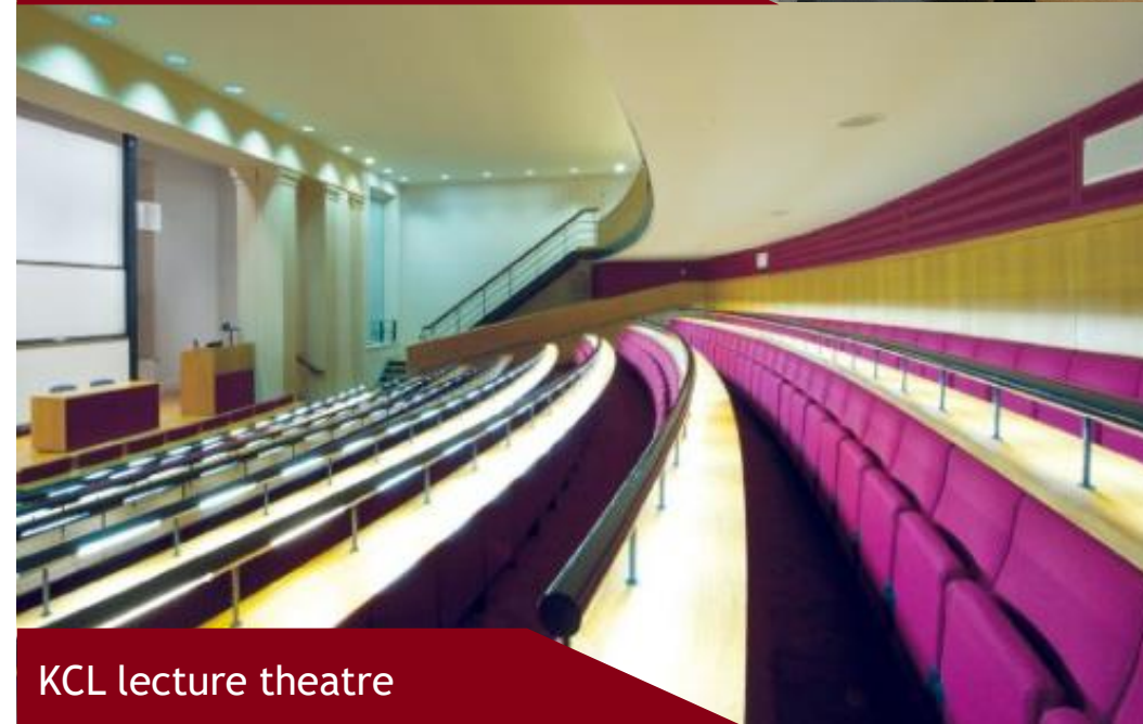
KCL lecture theatre